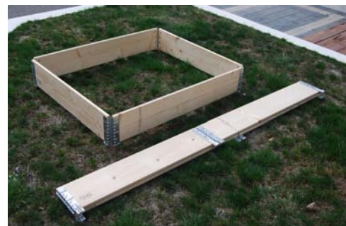
2 collars: one opened & one folded (above)