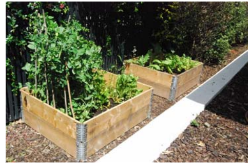
2 Double height vegetable beds

* Due to temperature & humidity changes in storage and during transportation, an occasional crack or split might appear. The protruding ends of the hinges can be sharp, so please handle with care. Simply use your gardening gloves at all times when setting up your raised beds!